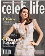
CELEB LIFE MAGAZINE