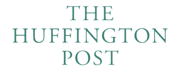
THE HUFFINGTON POST