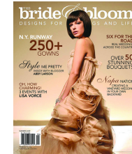
BRIDE & BLOOM MAGAZINE