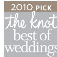
THE KNOT'S BEST OF WEDDINGS 2010 & 2012